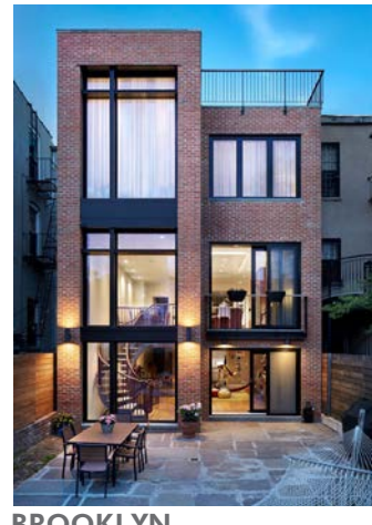
BROOKLYN CARROLL GARDENS