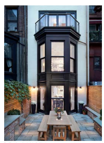
BROOKLYN BROOKLYN HEIGHTS