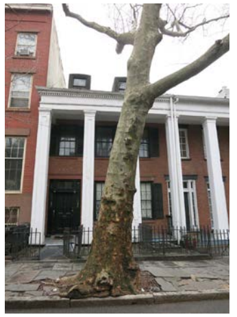
BROOKLYN BROOKLYN HEIGHTS

8 PASSIVE HOUSE PROJECTS, 6 DIFFERENT TEAMS ON THE DESIGN SIDE, AND 5 DIFFERENT CONTRACTORS.