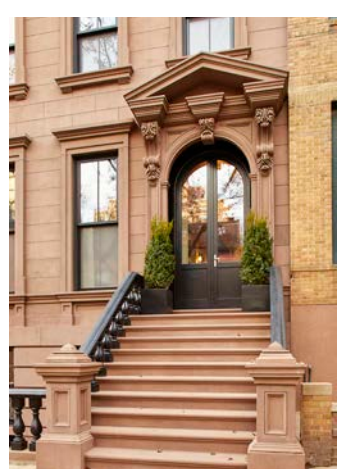
BROOKLYN BROOKLYN HEIGHTS