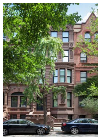
MANHATTAN UPPER WEST SIDE