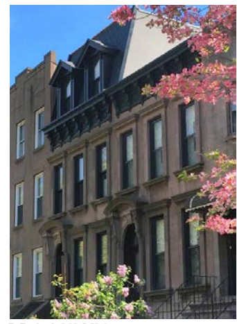
BROOKLYN CARROLL GARDENS