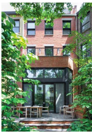
BROOKLYN BROOKLYN HEIGHTS