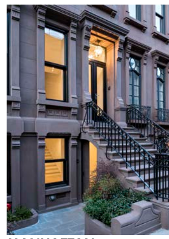
MANHATTAN UPPER WEST SIDE