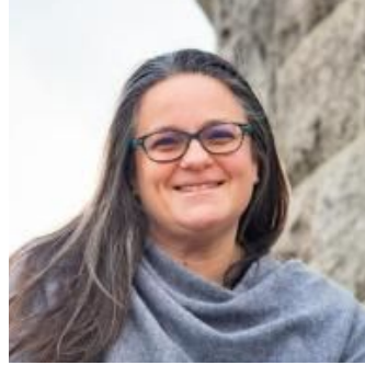
Meredith Elbaum Built Environment Plus USGBC MA / BE+ BG / GC Peer Networks