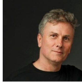
Jim Newman Linnean Solutions USBGC MA/ BE+ Living Future / BuildingGreen