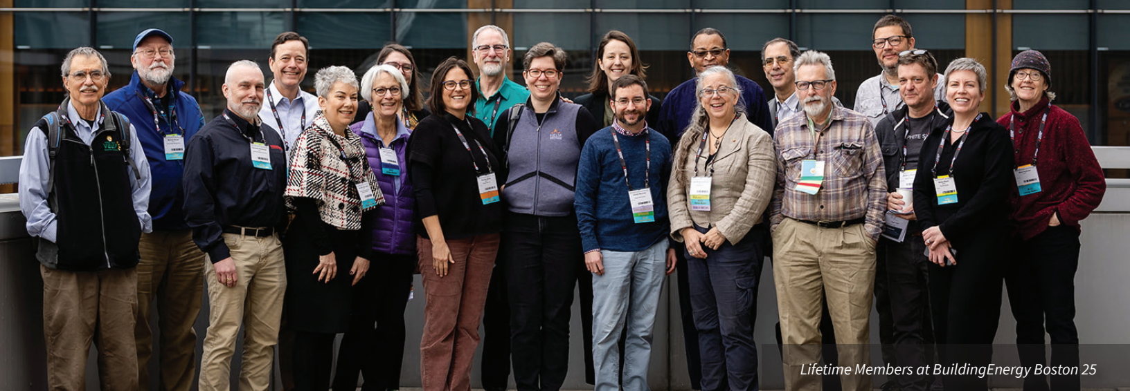
Lifetime Members at BuildingEnergy Boston 25