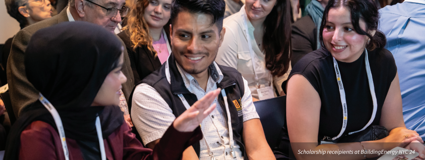
Scholarship recipients at BuildingEnergy NYC 24