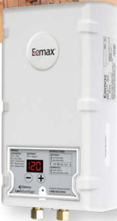
†City of Cambridge, MA, Net-Zero Action Plan:

https://www.cambridgema.gov/CDD/Projects/Climate/NetZeroTaskForce